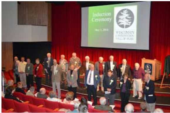
6. Recognition of Board of Directors and Governors