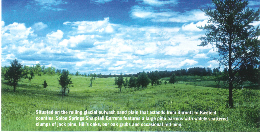
Situated on the rolling glacial outwash sand plain that extends from Burnett to Bayfield counties, Solon Springs Sharptail Barrens features a large pine barrens with widely scattered clumps of jack pine, Hill's oaks, bur oak grubs and occasional red pine.