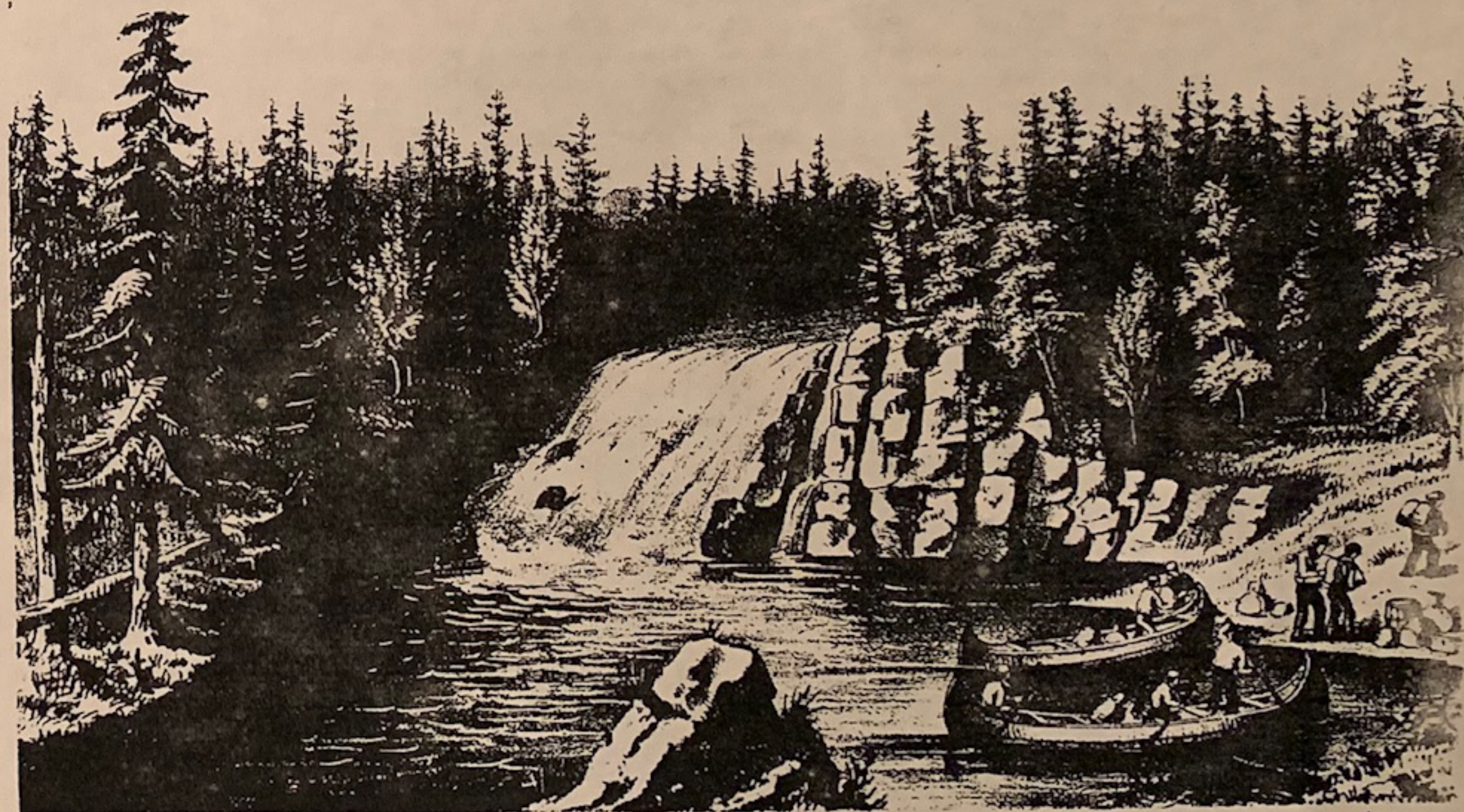
BIG BEKUENESEC FALLS, MEMOMONEE RIVER